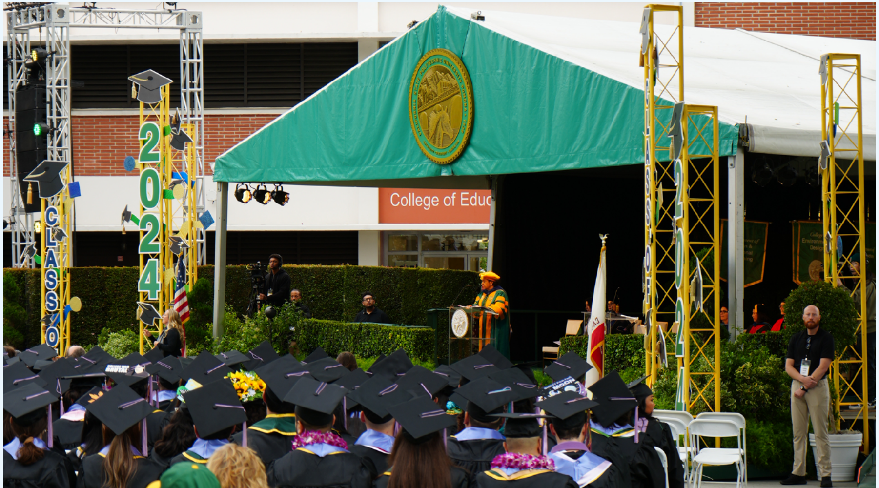
CPPE AT COMMENCEMENT SEE PG. 7